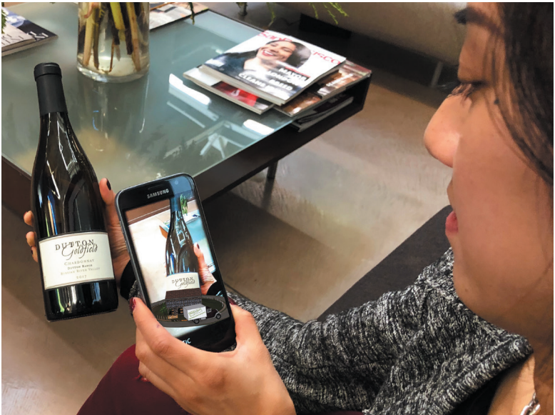
the sustainable winegrowing label can be applied either to the front or back label of the wine bottle