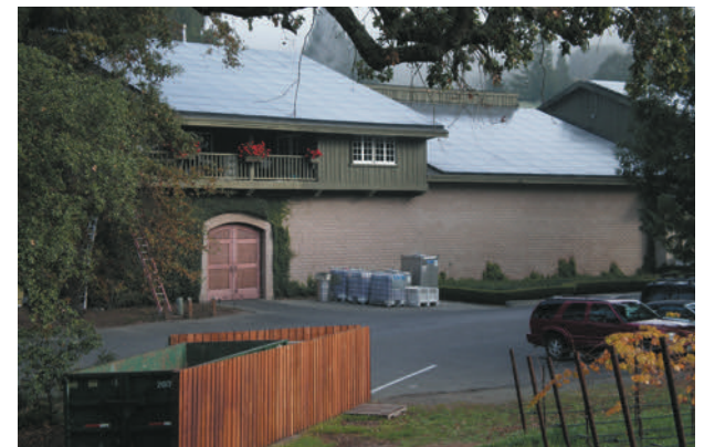
Some of the solar panels at Alexander Valley Vineyards

The combination of all of these programs has had a significant impact on the cost of energy for Alexander Valley Vineyards. Although the organization is not yet operating on 100% solar power, they were able to reduce their 2018 energy expenses by around 30%, representing an incredible economic and environmental win for the organization, and one that can continue to be realized year over year.