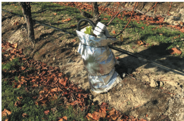
Saturas sensors measure vine water stress.

Merry Edwards Winery has long employed deficit irrigation in their 80 acres of Russian River vineyards. This not only helps the vineyards conserve water, but also increases the intense flavors of the wine grapes. Until this year, the winery monitored water stress or “stem water potential” in the vineyards using a pressure chamber. Unfortunately, this technology is limited as it must be measured within an hour of solar noon. In addition, the measurements can be inaccurate on extremely hot or cloudy days. Recently, the vineyard team joined forces with UC Davis and Saturas (Manufacturers of Ag irrigation equipment) to trial mini sensors imbedded in the vine trunk which directly measure vine water stress. These sensors will indicate when to irrigate vines by measuring stem water potential and forwarding information directly to a smart phone app. The sensors are not limited by time of day or the weather. Once out of the R&D stage, these sensors will help vineyard managers be more efficient in irrigation practices, potentially reducing water use and improving fruit quality.