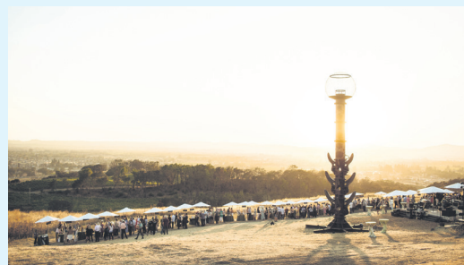
Guests gather at Paradise Ridge Winery in September, 2018 to celebrate ahead of Sonoma County Vintner’s annual wine auction.

The past year in Sonoma County has been unlike any other in recent memory. Much has been written about what was lost in October 2017, but an even more important story is the resiliency, spirit, community and beauty that remains.